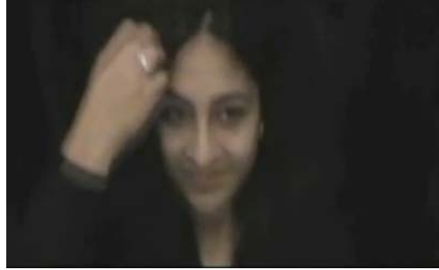
A close up of victims face happy on black back drop.