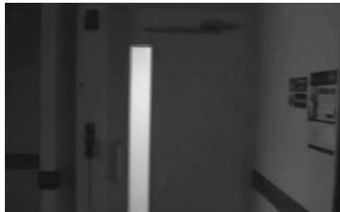
Mid shot of the elevator where victim was left by the killer