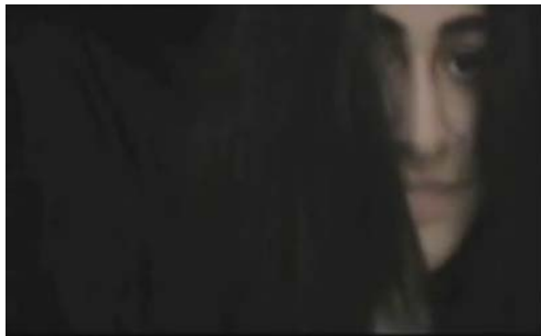
Extreme close up of victims face on black back drop.